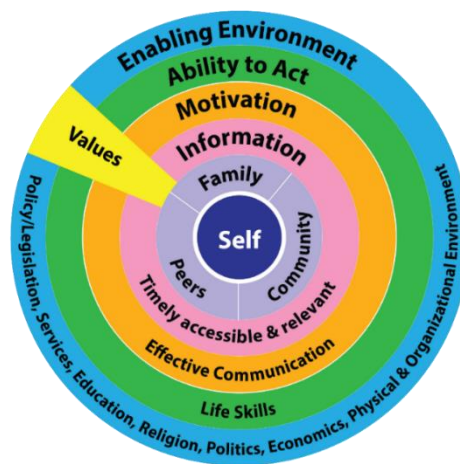
Figure: Strategic Communication Framework for Behavior Change and Development (Source: Approaches to Development Communication by McKee N, Manoncourt E, Chin SY, Carnegie R. (2000))

The Behavior Change and Development model for 'Involving People, Evolving Behavior' consists of concentric circles with the individual or Self at the core surrounded by family, peers and the community/society and will include the school and work areas. This level requires timely, accessible and relevant information to create awareness and improve knowledge of positive behaviors and practices. It is within the community that a road safety culture is developed, a social movement is established and positive behaviors are leveraged through peer to peer interactions and modelling behaviors. Effective communication through carefully articulated messages that resonate with the audiences will motivate and persuade them to change their attitude and behavior. The ability to act and adopt the behavior can be achieved through coping strategies and developing their skills to perform the required behavior.